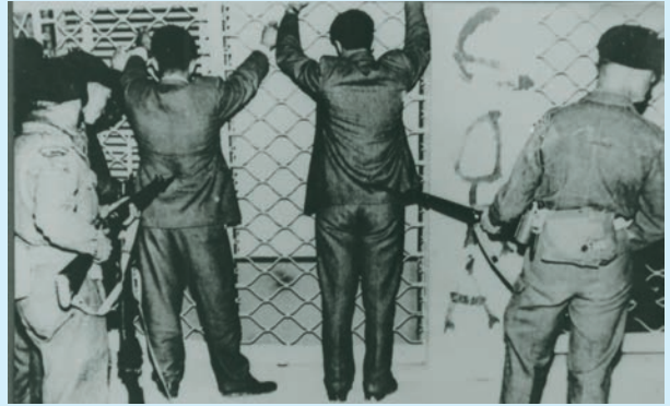
An everyday scene in the streets of Cyprus: searches, arrests, torture...