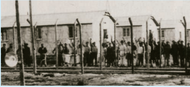
The Kokkinotrimithia Detention Centre. The colonial powers may have imprisoned the freedom fighters, but their soul and their spirit remained free

the gallows chanting the national anthem and were burned to death in their hideouts rather than surrender.