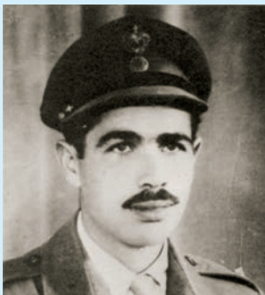
The sacrifice of Gregoris Afxentiou opened the way for national dignity and honour