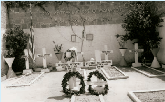
Imprisoned Graves. The British buried 13 heroes of the struggle here in secret in order to avoid popular demonstrations.

"We hunger for Greece though we are fed only stones".