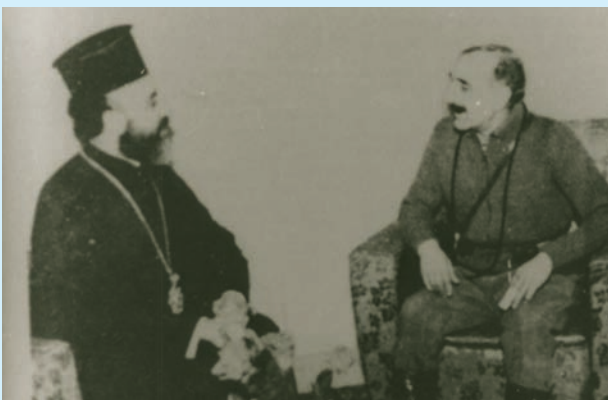
Under the leadership of Ethnarch Makarios and Dhigenis the Greeks of Cyprus wrote heroic pages in the history of Hellenism

The E.O.K.A struggle was above all a struggle of the young. The entire Greek world bows its head to them and salutes their heroic sacrifice, for they were examples of honour and heroism, examples of courage and endurance. In times of crisis for the nation the struggle of the Greeks of Cyprus, the struggle of E.O.K.A. opened the way for endurance, determination, national dignity and honour. This was the message sent out by the suffering Cypriots to Greeks all over the world.